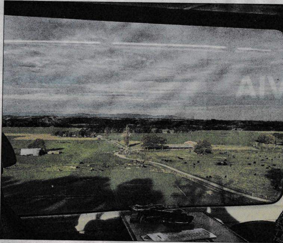
A GREEN AND LOVELY VISTA: Beautiful farmland views from the Northern Explorer.

As we start our 681-kilometre journey south, the excellent recorded commentary on the supplied headphones tells me Auckland is built on dormant volcanoes,